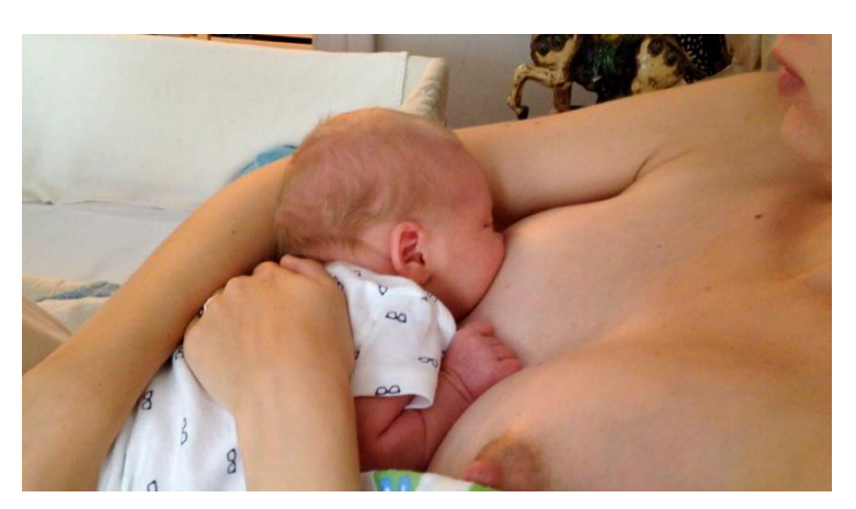
Figure 3. This woman presented with nipple pain. The baby was less able to extend his neck when breastfeeding on the right at first, due to the delicate shape of her breast. His most workable fit and hold was vertically down her body in a reclined position.

Figure 4 . He also fed comfortably in a reclined cradle hold.