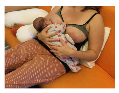
Figure 2 . This mother with a generous breast presented with severe nipple pain and damage. She achieved pain-free effective breastfeeding by experimenting with the principles of gestalt breastfeeding. She is in a very reclined position, which does not show in this photo. Whilst the baby has some lateral flexion of the neck, due to the way the mother's capacity to use her forearm as head support is constrained by the need to support her breast, she has found a fit and hold that is workable for them.

Figure 1. The semi-reclined position in gestalt breastfeeding