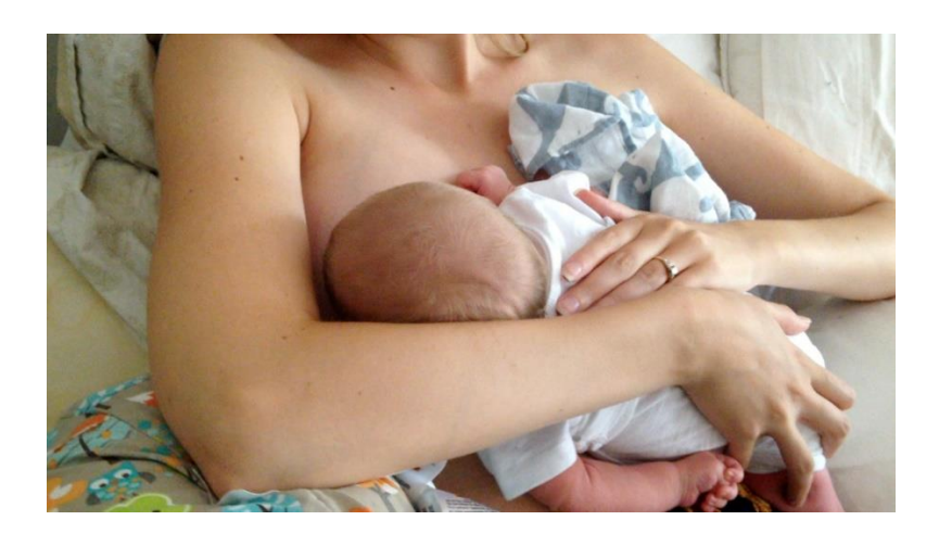
Figure 5 . In an effective face-bury, the lower half of the face is buried into the breast, with a parallel or square face-breast interface. The four points of the nose, cheeks and chin are symmetrically buried. The lips are not visible.

Figure 4 . He also fed comfortably in a reclined cradle hold.